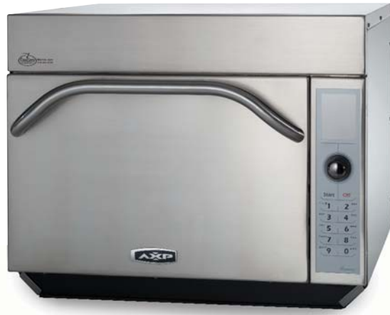
Model AXP20 shown