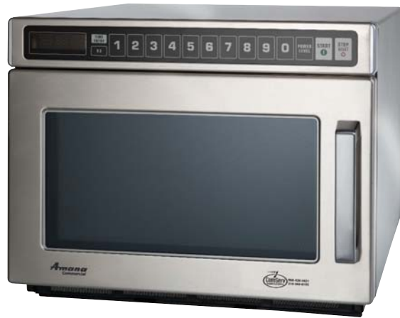
Model HDC182 shown