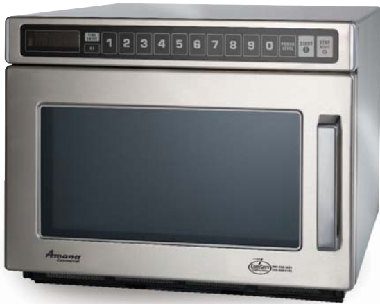
Model HDC212 shown