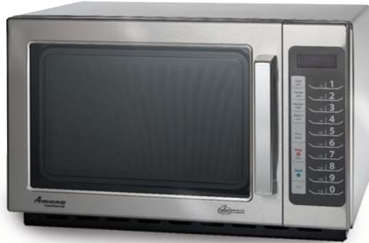
Model RCS10TS shown