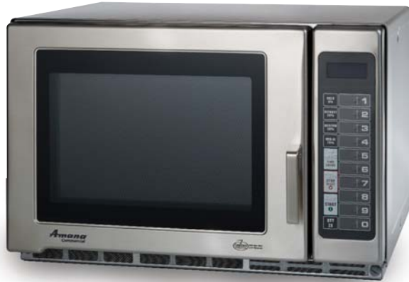
Model RFS12MPSB shown