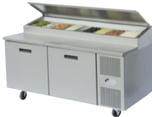
model 8268N shown

models: 8148N 8260N 8268N 8383N 8395N 84111N