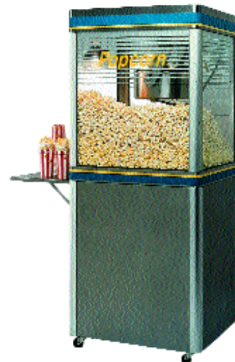
Model G14-Y (14 oz) or G18-Y (18 oz) on Model GPB-14 Base